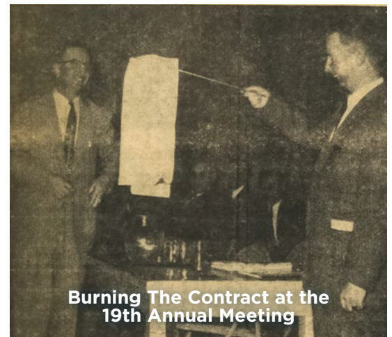
Burning The Contract at the 19th Annual Meeting

Members of District 3 may vote for the candidates at the Annual Meeting or by using the mail ballot included with the Annual Meeting materials they will receive in early April. As of the printing of this newsletter, the director election in District 1 and 4 are uncontested. No ballot will be mailed, and the candidates will be elected by acclamation at the Annual Meeting. Candidate profiles can be found on pages 2 & 3.