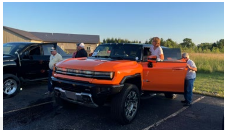
The REA Member Advisory Council enjoyed a beautiful night in August while checking out electric vehicles (EVs). A big thank you to Juettner Motors, Diamond Buick and Alexandria Motors for providing EVs for the evening.