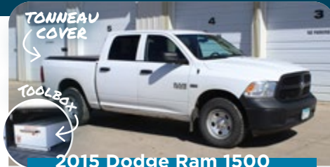
2015 Dodge Ram 1500

Extended cab, 5.7 Liter V8 Automatic Transmission, Power windows, locks, and mirrors. 213K miles. Sold with the strobe light.