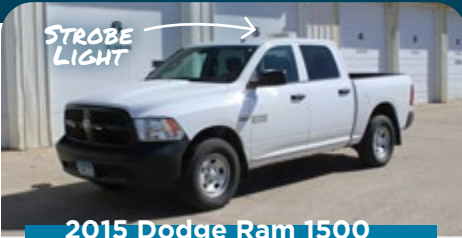
2015 Dodge Ram 1500

Extended cab, 5.7 Liter V8 Automatic Transmission, Power windows, locks, and mirrors. 213K miles. Sold with the strobe light.